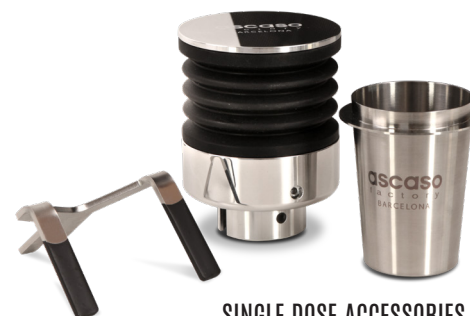
SINGLE DOSE ACCESSORIES

Enhanced antistatic system that prevents coffee from adhering to the metal walls. Ensure consistency in every service.