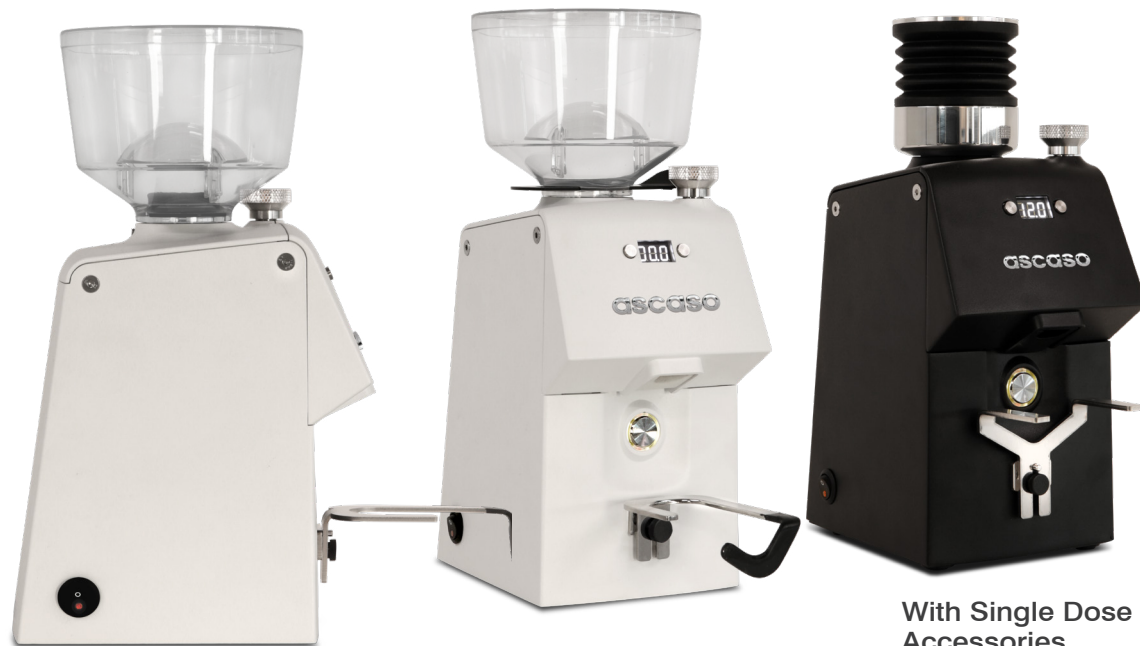
With Single Dose Accessories